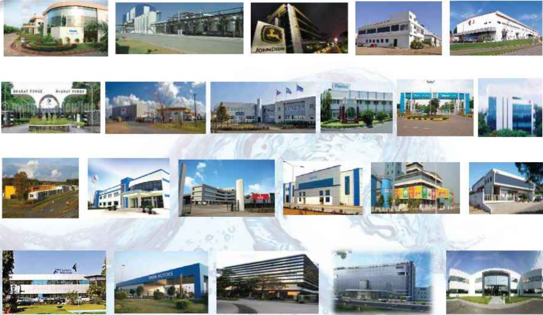
and many more...